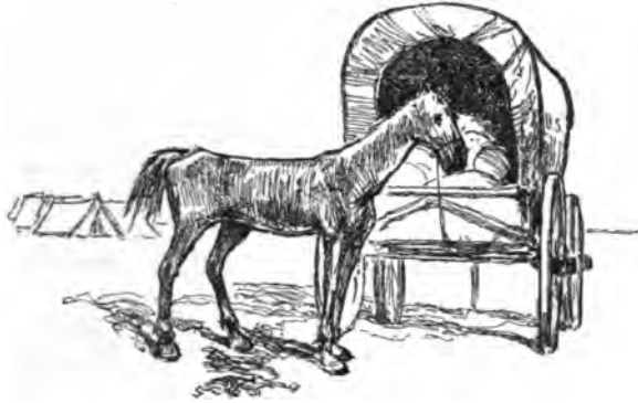
THE COLONEL'S SPARE HORSE.

was turned. Then half the regiment spent an hour chasing the luckless animal and pelting him with clods. The treatment was heroic but successful. The spare horse went back to duty a little out of breath, but in good order.