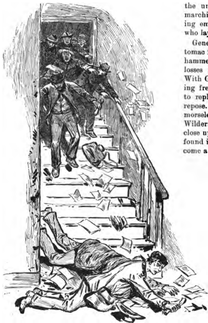
IN THE WILDERNESS TAVERN—STARTLING EFFECT OF THE "REBEL YELL."

followed an awful scene of human agony. The men borne from the field during the fight were but a fraction of those who fell. Thousands of maimed and shattered but living men lay about in the forest. The night settled down, and through the gathering gloom rose a vast chorus of anguish. Piercing shrieks, appeals for the mercy of death, with an underbreath of moaning, swelled the whole into a peal that voiced the pitiless cruelty of war, while, like the thrumming of a rude accompaniment, the strange crackling of the underbrush, stirred by the struggling bodies, added to the horror of the sound. There was no glory here.