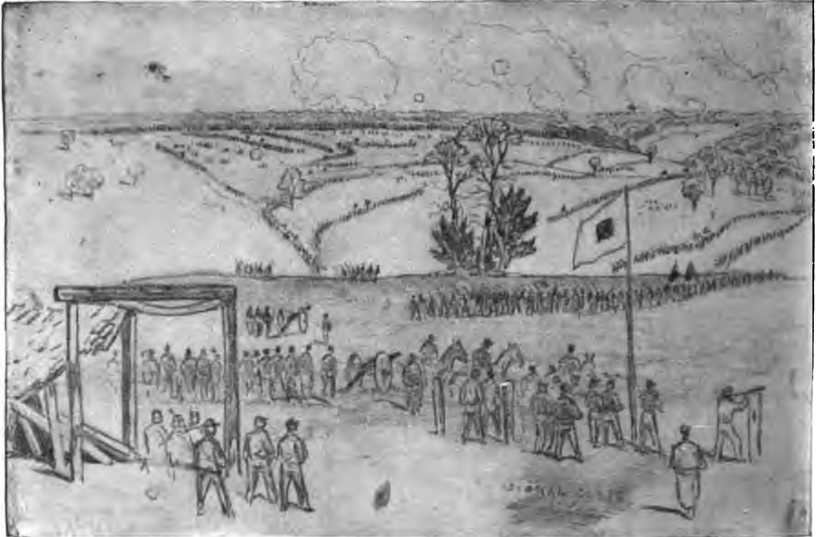
BATTLE OF THE WILDERNESS, MAY 6TH, 1864.—(FAC-SIMILE OF THE ORIGINAL SKETCH.)