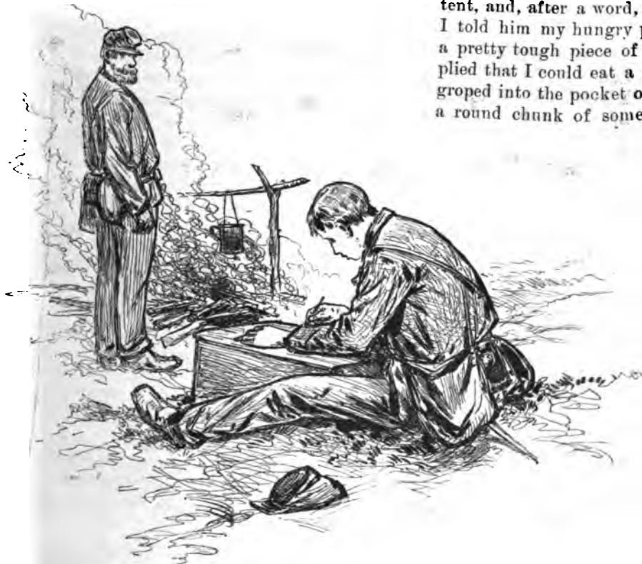
"MOTHER'S BOY" WRITING HOME, AFTER A BATTLE.

The road was blocked with wagons, and during the halts thus caused I fell in with Hancock's corps. There were some wounded men in the wagons who noticed my occasional sketching. They saw, too, that my haversack was empty and my face