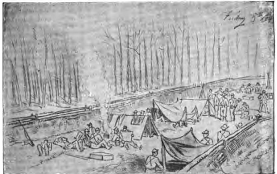
THE "FIGHTING FOURTEENTH" OF BROOKLYN—EXTREME FRONT, LEFT CENTRE, FRIDAY MORNING, MAY 6TH.—(FAC-SIMILE OF ORIGINAL SKETCH.)

But when the roar of the battle died away there