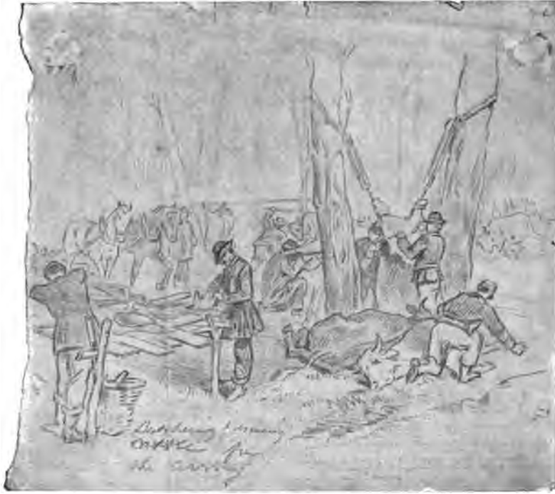
TURNING LIVE CATTLE INTO BEEF.—(FAC-SIMILE OF ORIGINAL SKETCH)

zeal by the rawest recruit—myself. By uncommon vigor I reached the top of the banisterless stair, neck and neck with the valiant war correspondent of the Cincinnati Enquirer . In our eagerness to lead the rout we fell together headlong down the long flight, amid a flutter of sketches and copy grabbed instinctively as we made the rush. The others rolled down on top of us, and by the time we were disentangled the cause of our fright was over. It was the fierce and famous "rebel yell" welcoming approaching reinforcements in the sanguine belief that with their aid the Yankees would be whipped and that Grant had started