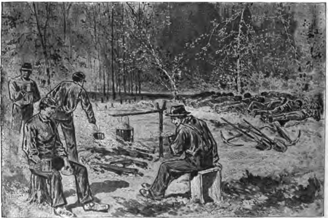
WILDERNESS—LEFT CENTRE—A BURYING PARTY AT BREAKFAST, FRIDAY MORNING, MAY 6TH, 1864.