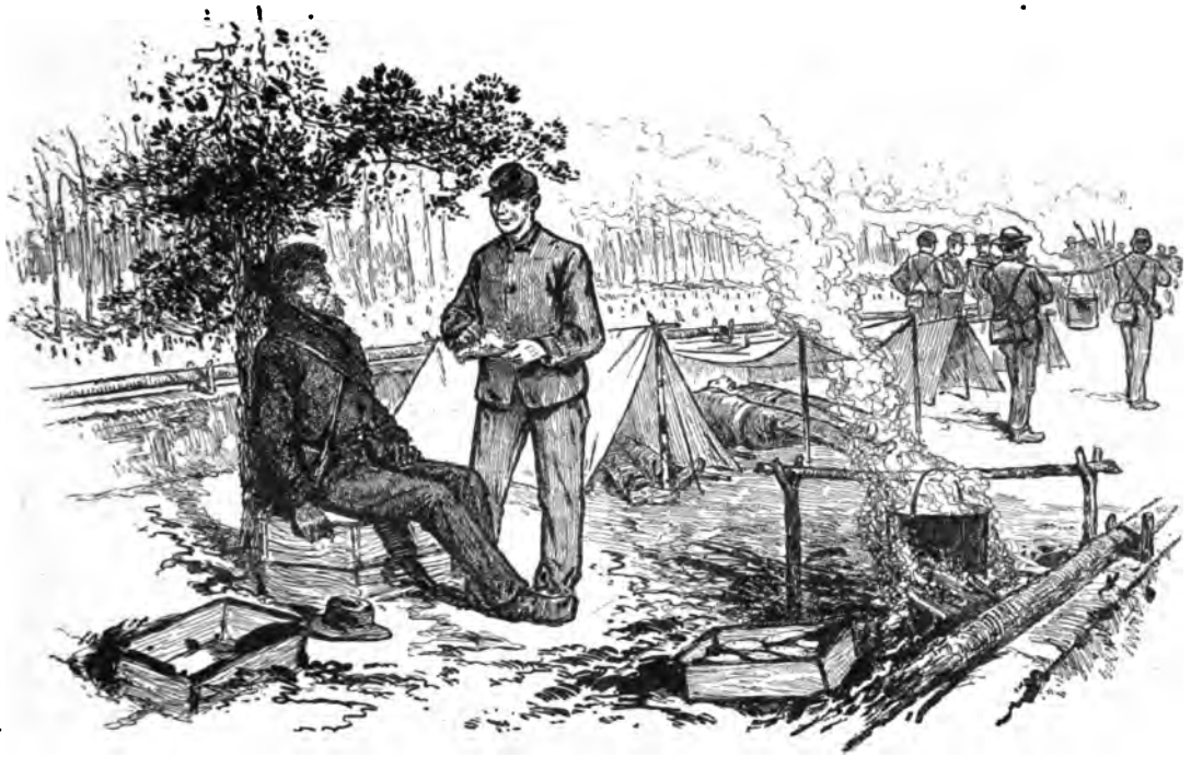
"ONE FELLOW PROPPED HIMSELF AGAINST A TREE WHILE A COMRADE COOLLY LATHERED AND SHAVED HIM."

scattering. The staff officers ducked their heads, and were distinctly uncomfortable. Not so the general. He was not a very large man, but somehow he loomed up into an impressive figure on horseback. He gave no sign of interest in the screaming missiles, and moved only as he occasionally took his cigar from between his lips, or replaced it there. He had an odd way of holding his weed. It would rest on the back of his thumb and middle finger, with the forefinger lapped over it like a clamp, not between thumb and finger, as most men handle cigars.