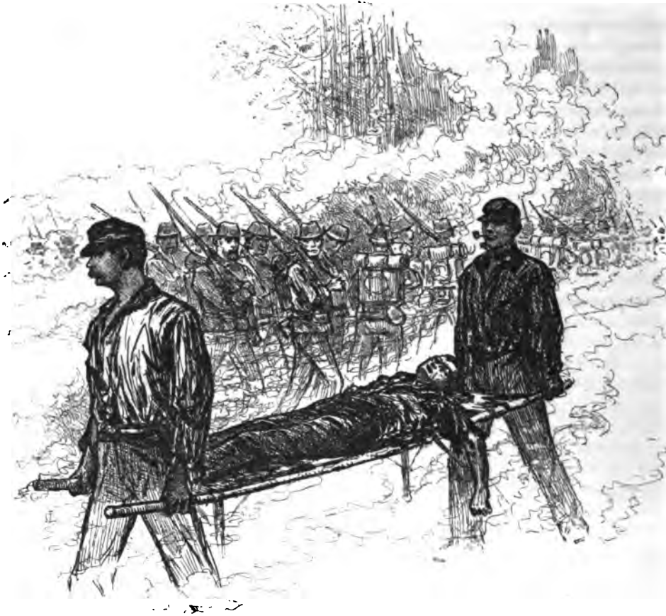
A GLIMPSE OF THE HORRORS OF WAR.

army. In fourteen of these, from May 5th to May 18th, inclusive, 10,000 Union soldiers had been killed in battle in the Wilderness and at Spottsylvania, and 40,000 had been wounded. These losses, the most terrific of all the war, filled the North with mourning. Looking backward now, it seems incredible that these battles had the effect of victories in crushing the Confederacy. Of the volume of human suffering that attended them there can be no estimate. Where the dead are counted by thousands and the wounded by tens of thousands the horrors of war become too great for computation.