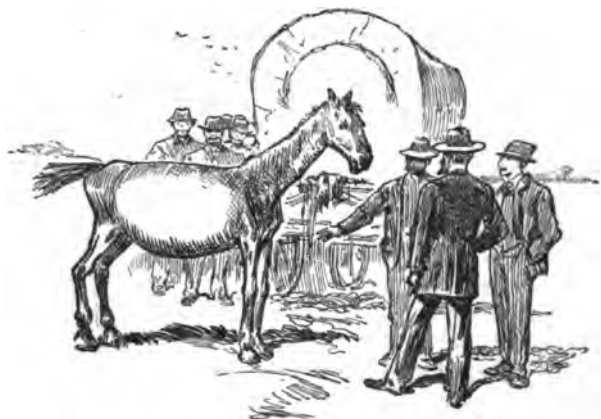
THE MORNING AFTER.

With twenty other artists and war correspondents I took possession of an upper room in the tavern. Here, around several rickety old tables, we contrived to accomplish some work for immediate forwarding. The correspondents could get a few lines through recording the progress of the fight, and the artists used the time to the best possible advantage—not knowing when the next chance would come. Suddenly we were appalled by the most unearthly yell that ever came from human throats. Distant as it turned out to be, the volume of sound raised by ten thousand tongues seemed to be all about us. The old campaigners waited not an instant upon the order of their going. In this they were emulated with