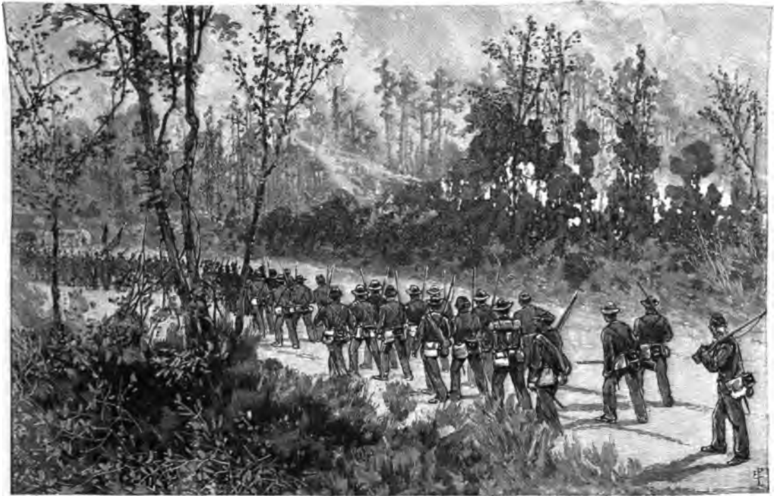
CONFLAGRATION OF THE WILDERNESS BATTLEFIELD.

gaunt with hunger. "Hey, Mr. Artist!" called one of them. "The Sanitary Commission has been along and left us a load of crackers. Help yourself." I did not need a second asking. I packed my stomach and my haversack, and was a new man again.