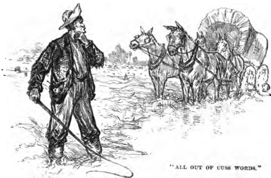
"ALL OUT OF CUSS WORDS."

Just before the battle began at Spottsylvania I fell in with the One Hundred and Ninth. I was literally starving, and tried to beg a biscuit or two from the men. Each refused. They did not know when they could get more, and had nothing to spare from their slender store. They were right. I was a non-combatant and had no claim to share a sol-