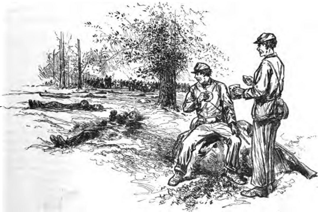
LUNCHING ON THE FIELD OF CHANCELLORSVILLE.

more or less safe distance were most particular that no one should approach them from the south without proper credentials. I knew that here my letter would not vouch for me. It was after one o'clock in the morning when, worn out with worry, hunger and fatigue, the slamming of the gang plank on the wharf told me I must do something smart if I wished to escape a sojourn in the Old Capitol Prison. The first man to land was the major in charge of the invalided detachment. He had a small hand bag, and made a rather hurried start up the plank. I followed at his heels like an attendant, and as we passed, the sentry made a reach for the bag, but of course did not touch it. The next man with a gun poked his bayonet tentatively toward me, but with a hand wave in the direction of the major I kept right on. It was nearly an hour's walk to Pennsylvania Avenue, but I managed to drag myself up to the door of an ancient hotel, small, but good enough for a change after my adventures. The only man in the bar as I fell in was the proprietor, and to do him full justice he was prepared for me. He reached for a navy revolver, and gave me a minute to get out. There was nothing wrong in judging me by appearances. I was a miserable mockery of a man, and lacked even the quality of picturesqueness. Under cover of the