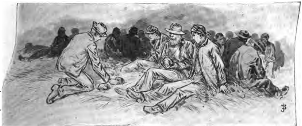
"I HEWED THE BREAD AND MEAT INTO SLICES."

But twenty days had passed since I joined the