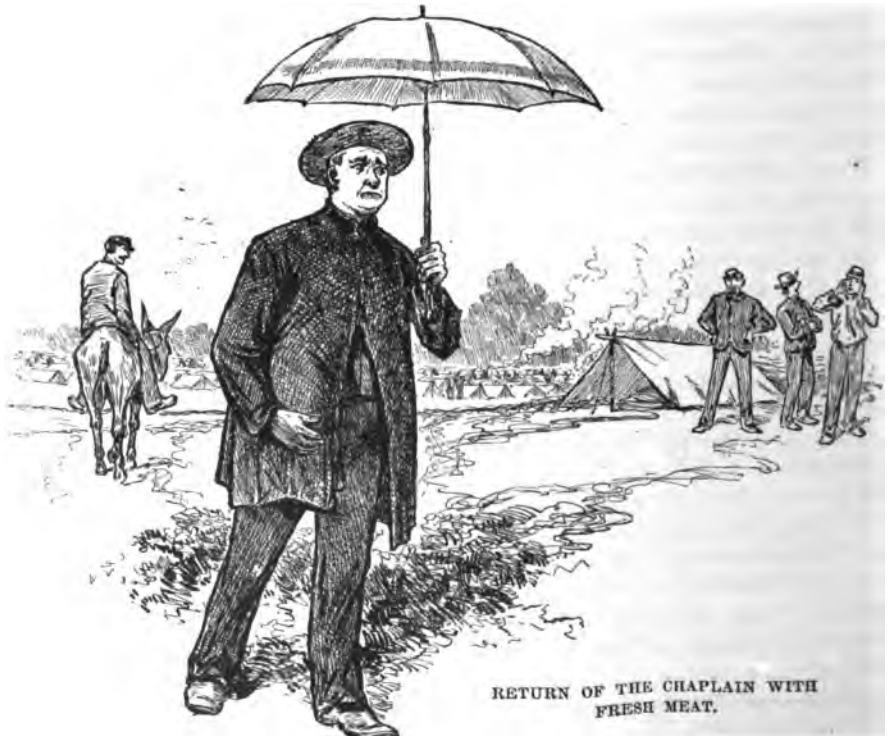
RETURN OF THE CHAPLAIN WITH FRESH MEAT.

Outside the Wilderness Tavern General Grant and his staff watched the course of the battle. It was my first view of an engagement, but I remember that I was more interested in observing General Grant's manner than in the clash of the armies. His imperturbability was complete. In time a considerable group of orderlies, staff officers and correspondents gathered about the neighborhood, and the rebel gunners, imagining that