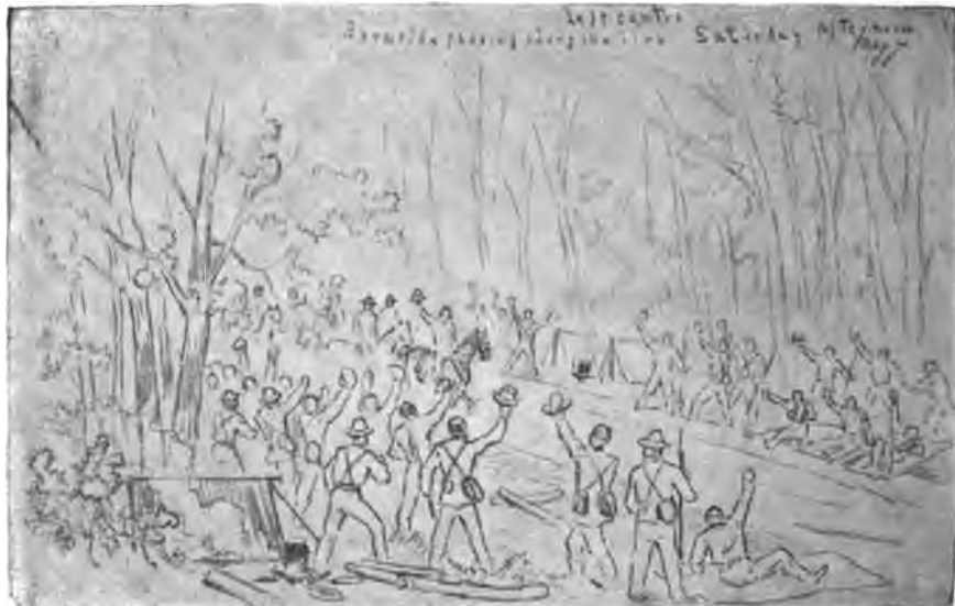
IN THE WILDERNESS.—(FAC-SIMILE SKETCH.)